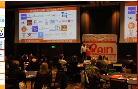
International Pain Summit 2019 © Comic Pain Relief 2019 ©